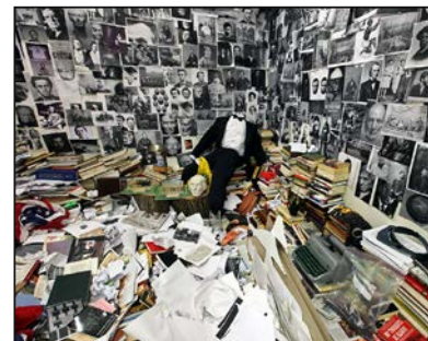
Right: John Neylan, End the Confusion , 2013, installation, 12 x 12 feet.

End The Confusion is an installation, drawing, and performance that explores American history through the lenses of the conspiracy theorist, the artist, the historian, and the hoarder. The artist began with the question proposed by Walter Benjamin in his final written piece, Thesis on the Philosophy of History : what are we to make of the endless pile of corpses that is a result of human history? An underlying faith in humanism emerges in Neylan's examination of these various approaches to history, but it comes with the caveat that it can also lead to a prison of the mind.