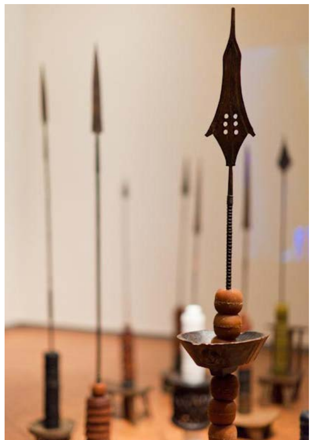
Maria Magdalena Campos-Pons, Sugar/Bittersweet , 2010, mixed media installation (wood, glass, raw sugar, metal, video, stereo sound), courtesy of the artist.

Wednesday, October 23, 6:00-7:30pm Multipurpose room, Sophia Gordon Hall, 13 Talbot Ave